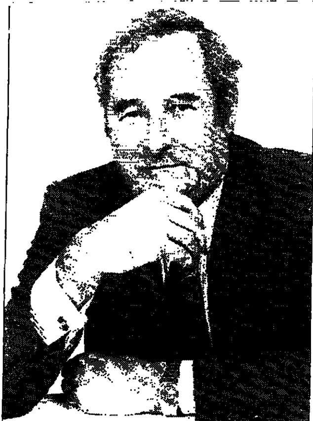
The superspy's creator, Gérard de Villiers.

blood, the recipe for Malko's subsequent success has been simple: Mix violence, sex and travel with attention to detail. The French literary world, often precious and elitist, looks down on de Villiers's efforts, often crude and rightist. He returns the favor.